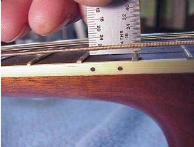
The distance between fret board and strings should be as minimum as possible

The distance between guitar fret board and strings is called "Action". If the "action" or string height is too high, the instrument will be much more difficult to play. The classical guitar is a bit different. It uses nylon rather than steel strings. The action is sometimes higher than on the steel string, and the neck is wider. The distance between fret board and strings should be as minimum as possible